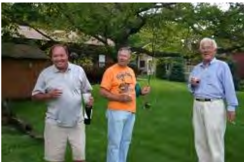
Having fun at the Chapter BBQ