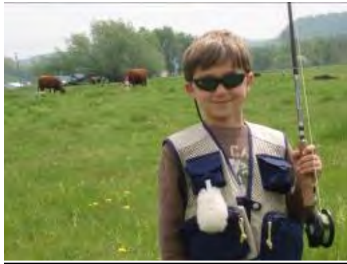
Getting to know the local wildlife! Note cool Power Ranger Glasses.