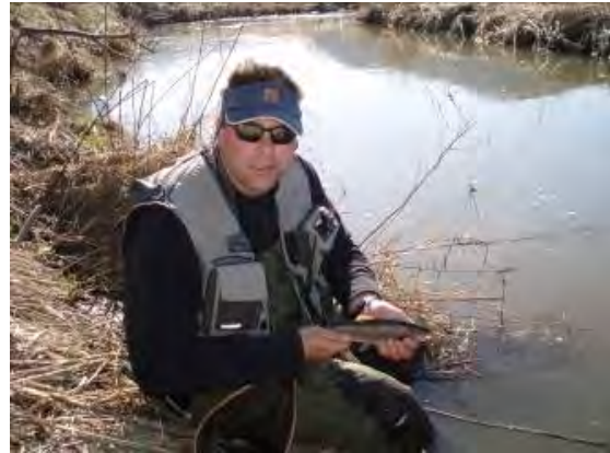
Your Editor, filling space with a picture of himself with a dinker.