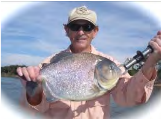
Piranha on the fly?